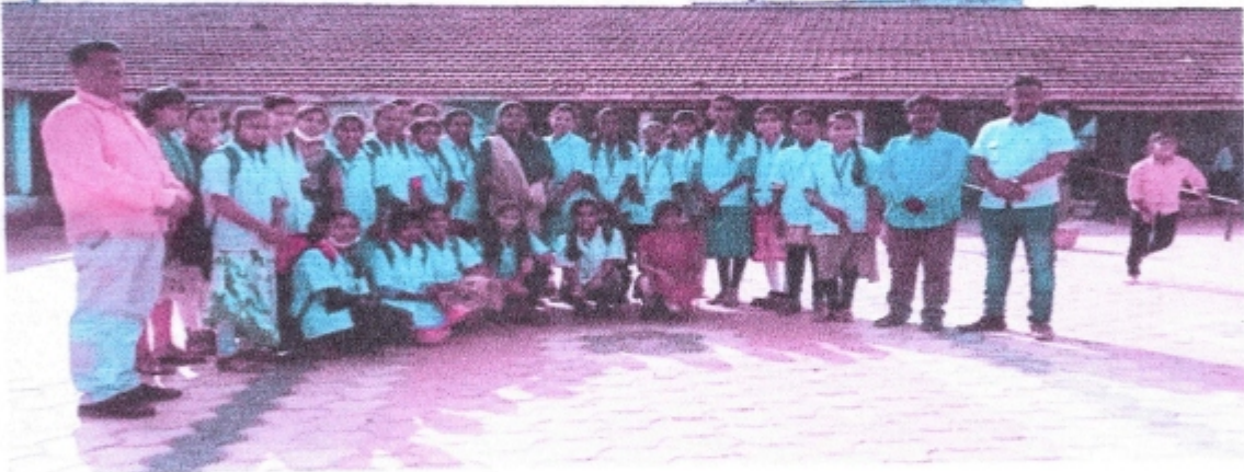
Caption: some photograph during HB and blood group checking at place in turambe 31/12/2021.