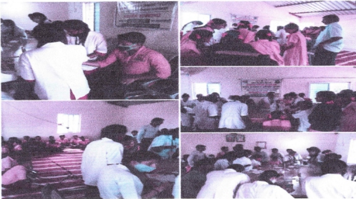
Caption:-Our DMLT students while checking HB and blood group at place in turambe 31/12/2021