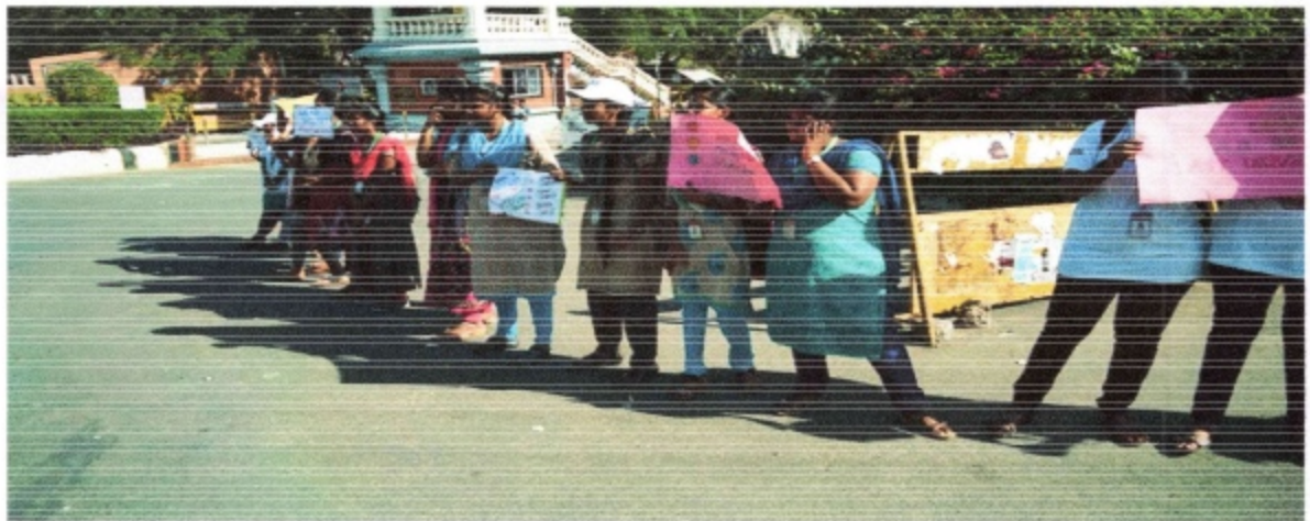
Photos From Road Safty Awareness Program.