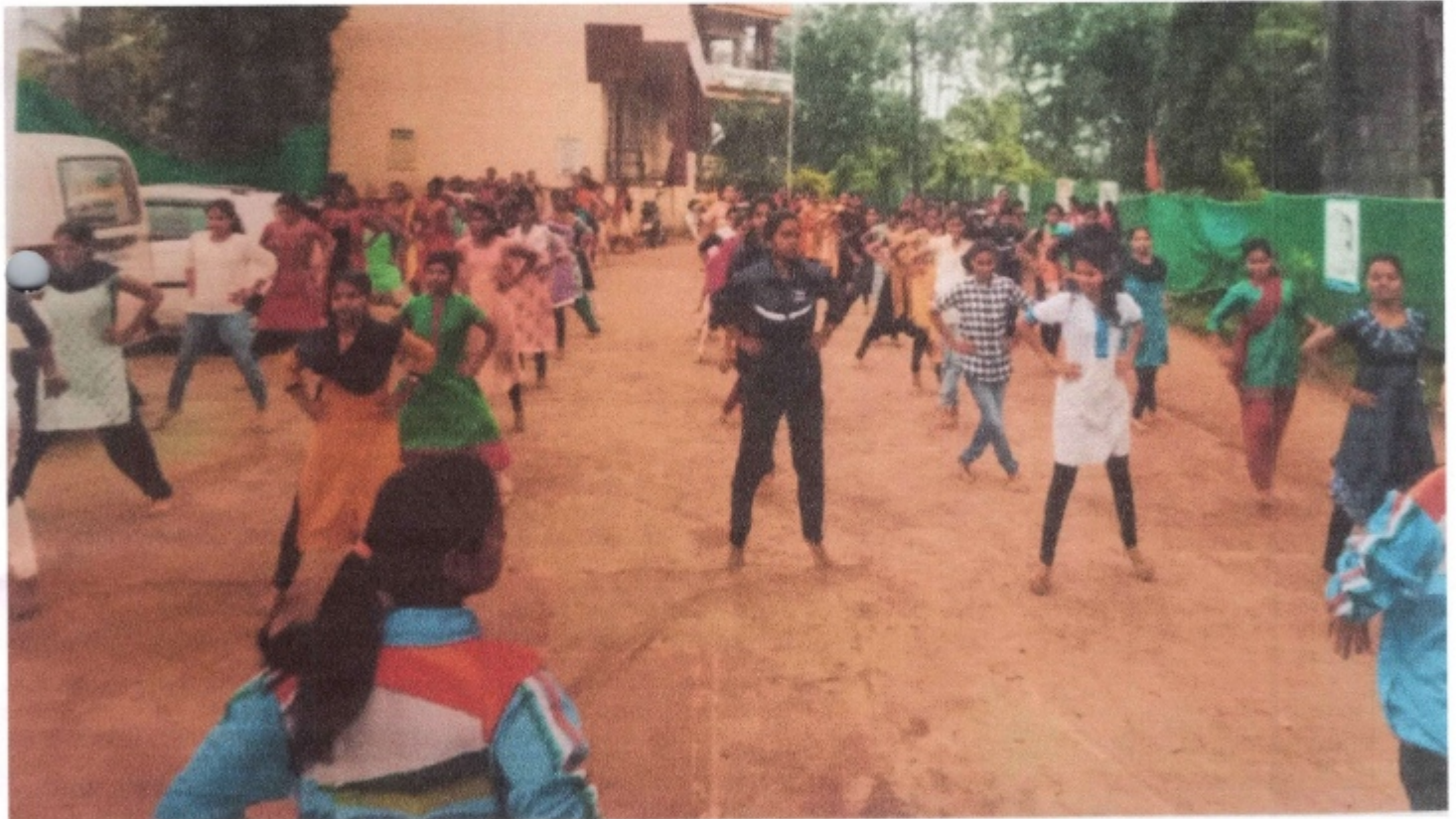
photo from Karate & self Defense workshop. 20/oct/2021