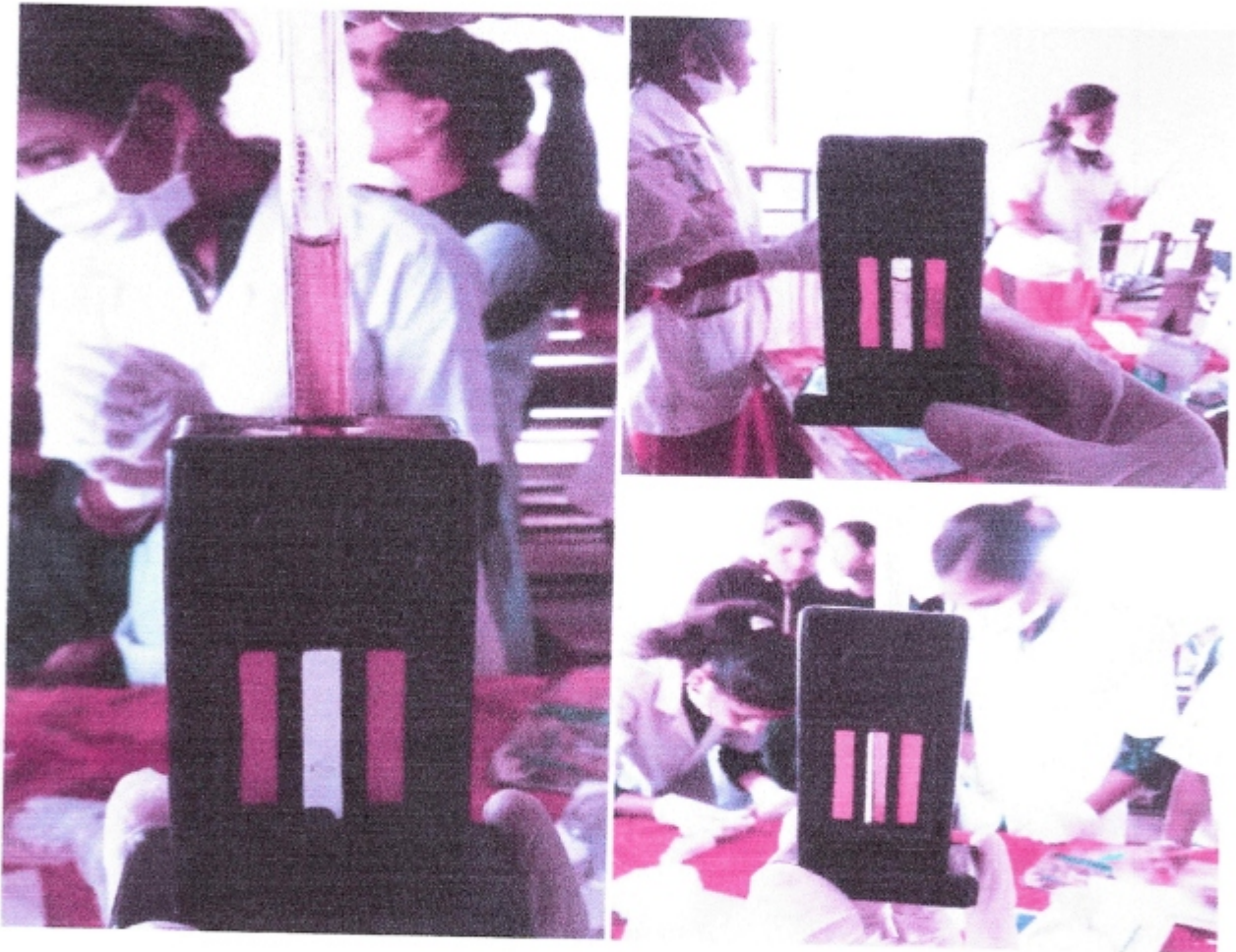
Caption: Some photographs during HB and blood group checking at place in Walave