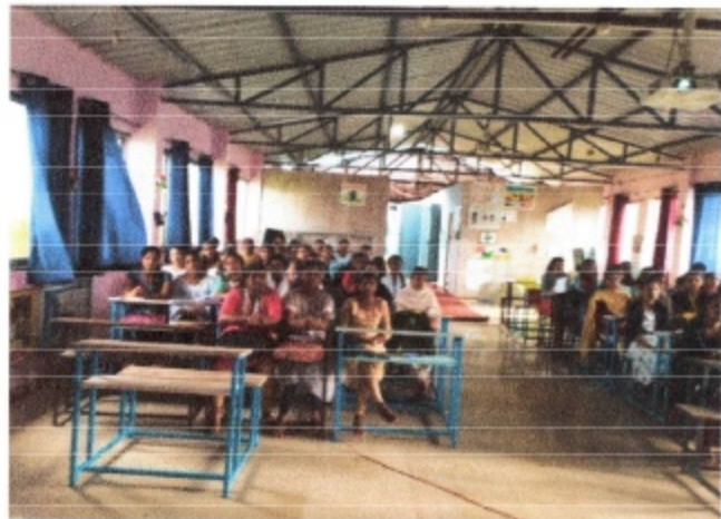
Student Attend the lecture Carefully.

[Signature] Head H.O.D. Department Of Computer Science