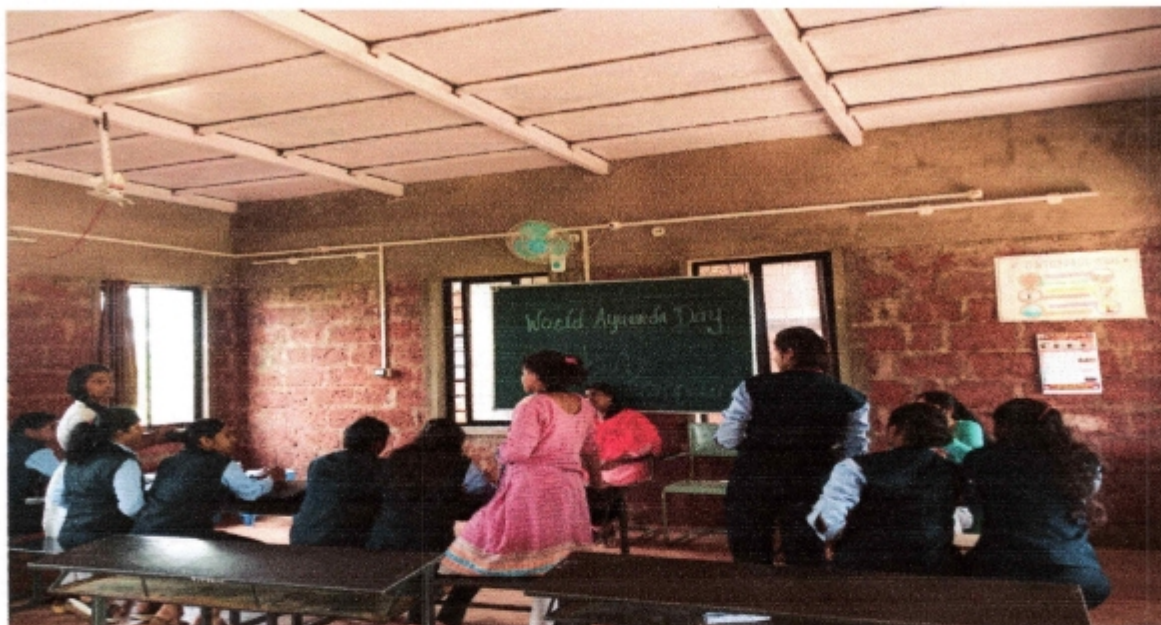
Caption: Some photographs of Debate competition

All competition was very creative and inspiring to students. We are selected some of them as Winner