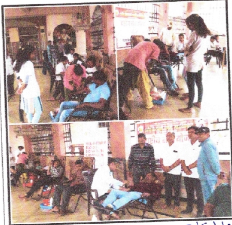
Some photos of the camp. 2/Feb/2023