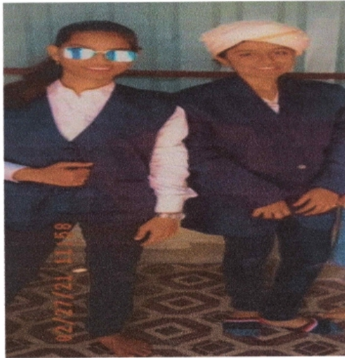
Caption: - Traditional Look by our students