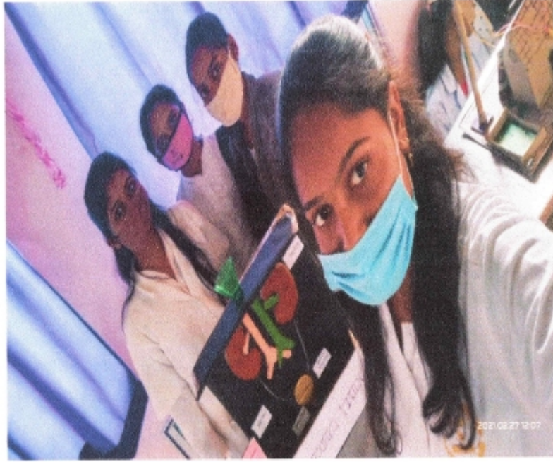
Caption:- Model Presented by Our Student