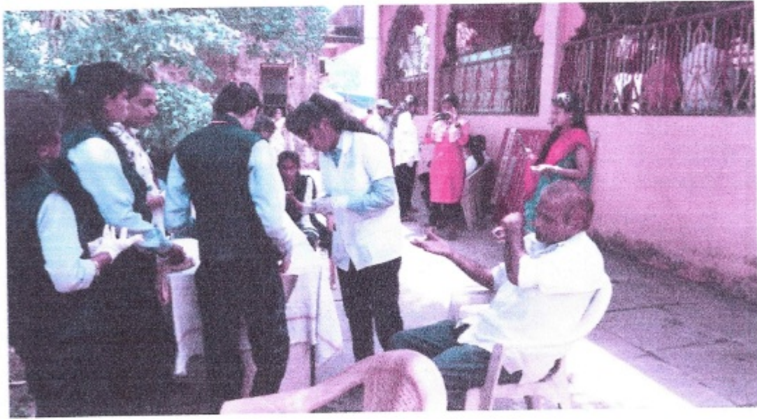
Caption: some photograph during HB and blood group checking at place in Turambe (19/APR/2022)