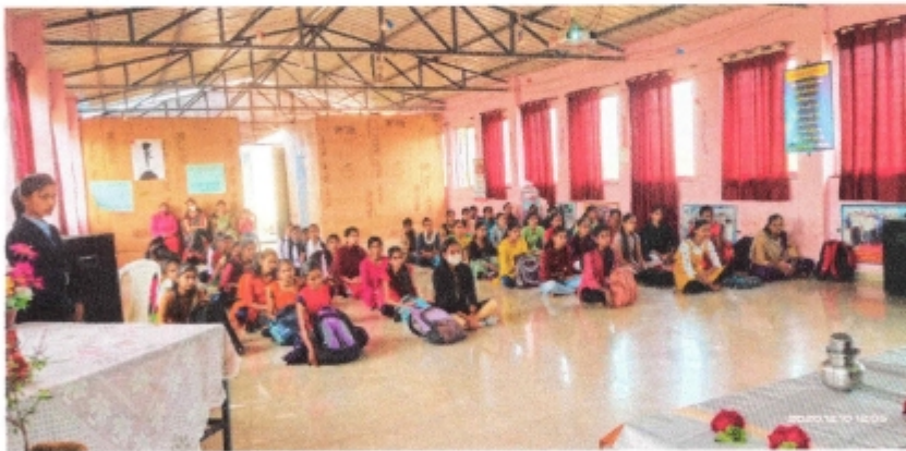
Caption: Guest Lecture Attended by B.Sc. I and DMLT.-I year Students