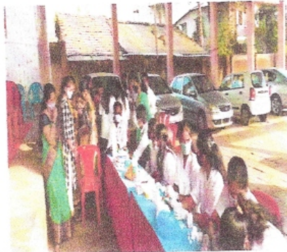
Caption: Some photographs during blood group checking camp.