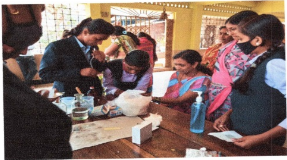
Caption: Arjunwada Village Students and Women's HB and Blood group checked by our DMLT and B.Sc. Students. (9-03-2022)