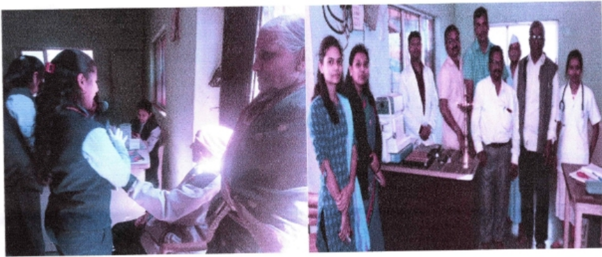
Caption: Some photographs during blood group checking camp.